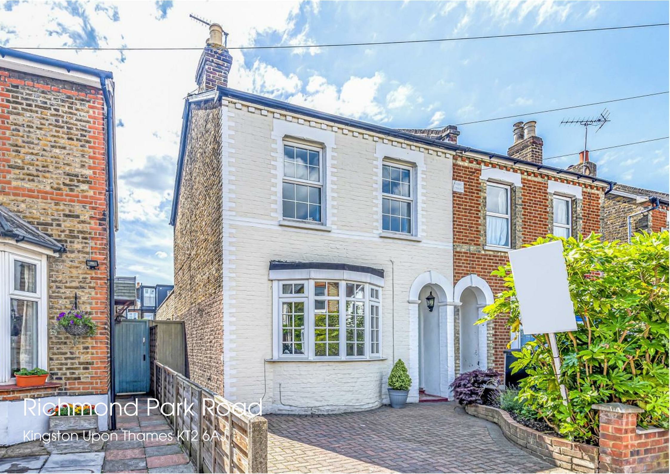
Richmond Park Road Kingston Upon Thames KT2 6AJ